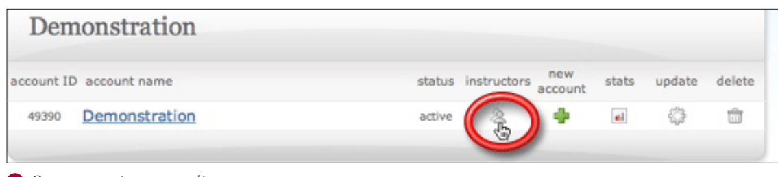
6 Opens your instructor list

If you would like, you can manually add instructors to your account. To add an instructor, click the instructors button on your administrator homepage 6 .